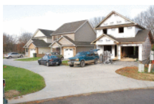
A Foothills Community Development Corp. home is under construction next to already completed FCDC homes in Lennox Square off Montvale Station Road in Maryville.

The Foothills Community Development Corp. is offering people the opportunity to fulfill the ultimate American dream — ownership of a new home to hold the Christmas tree next year.